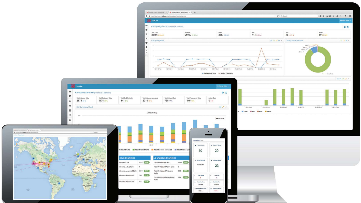
8x8 Virtual Office Analytics

Have you ever asked yourself, "Are we missing calls and losing business?" "Are we getting the service quality we pay for?" "Who returns customer calls—and who doesn't?" These are just a few of the questions you can answer at a glance with 8x8 Virtual Office analytics dashboards and reports. Manage strategically—even globally—with real-time information that helps you make faster, better decisions in time to make a difference.